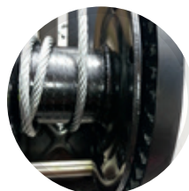
Winch with gear protection casing