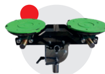
Glass suction cups up to 180kg