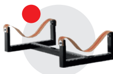
Support for curtains