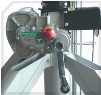
Manual use With crank provided