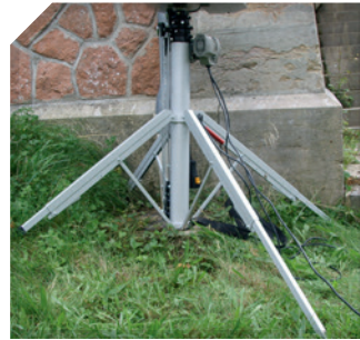
Four extendable feet For work on slopes