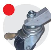
Wheels kit 1 ruota per palo 4 ruote per piedi