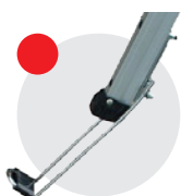
Drywall Support for mounting plate Ceiling