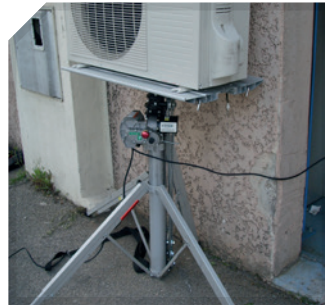
A resealable foot To place it close to walls