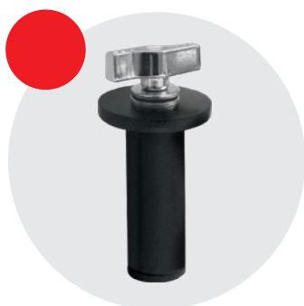
LED LIGHTS SUPPORT Quick coupling, for lifting of LED lights from lighting