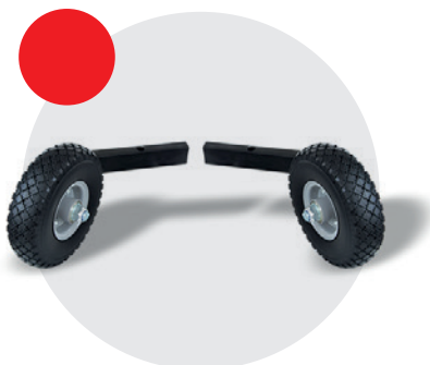
WHEELS KIT RD-02 Flat freewheels