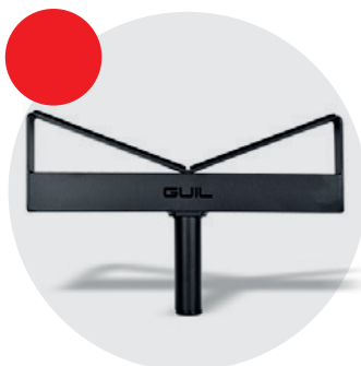
LOAD SUPPORT CYLINDRICAL Quick connection, easily interchangeable with the platform supplied as standard