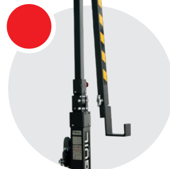
SUPPORT GAZEBO Quick coupling, for lifting of assembled gazebo structures