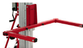
ACT-09 Expander with forks