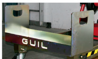
CB-01 Basin Counterweight