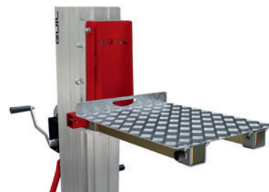
ACT-04 Loading platform