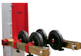
ACT-06 Support for roller shutters or shutters