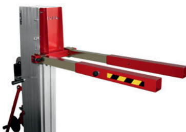
ACT-02 Fork extensions