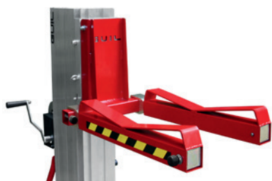
ACT-01 Support for cylindrical loads