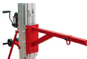
ACT-08 Support with hook